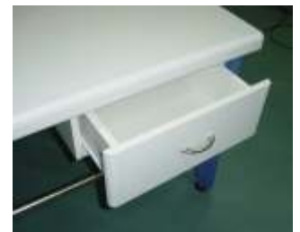
Single Drawer Unit