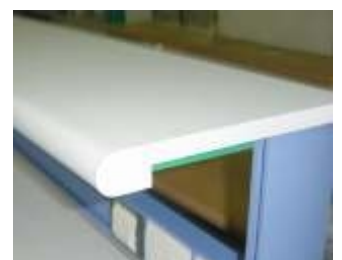
Rounded Table Corner