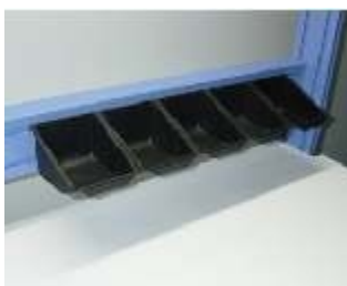
Set of Bins

Be it an office or factory environment, these tables can be used for office work, assembly of parts, meetings and in a training centre or a design centre. These have a thick top with rounded front edge for comfortable and safe working. Standard table is without any drawer or shelf but these can be ordered as per ones needs. Legs of the table and side supports are made from thick aluminum profile. If required, these can be equipped with leveling screws or castors. Therefore, these tables can be used as Test Benches also.